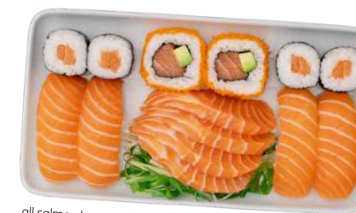
all salmon love set

salmon + tuna collection £17.50 2 YO! rolls, 2 salmon maki, 2 tuna maki, 2 salmon nigiri, 2 tuna nigiri, 2 thick cut slices of salmon & 2 tuna sashimi